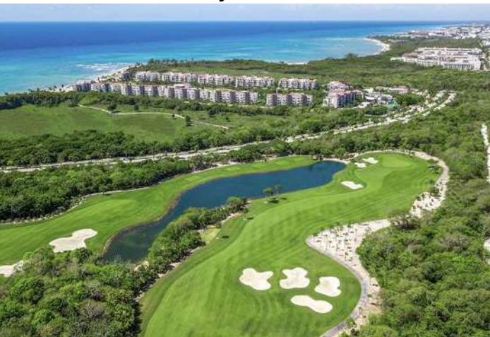
Golf Course Gran Coyote