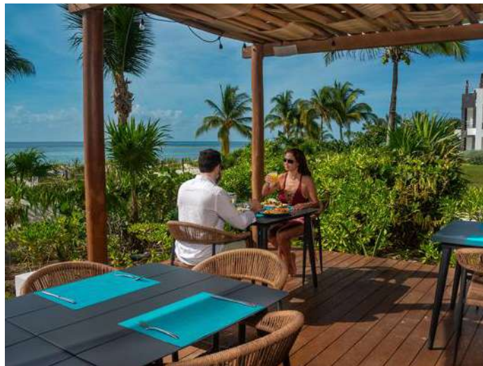
Faro Azul Grill