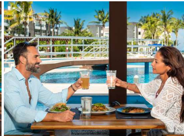
Punto Azul Gastrobar