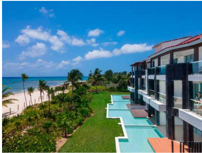
237 meters of beach with exclusive use for Mareazul owners