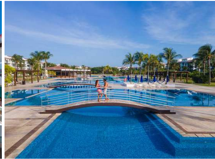
Swimming Pool with 130 m wide