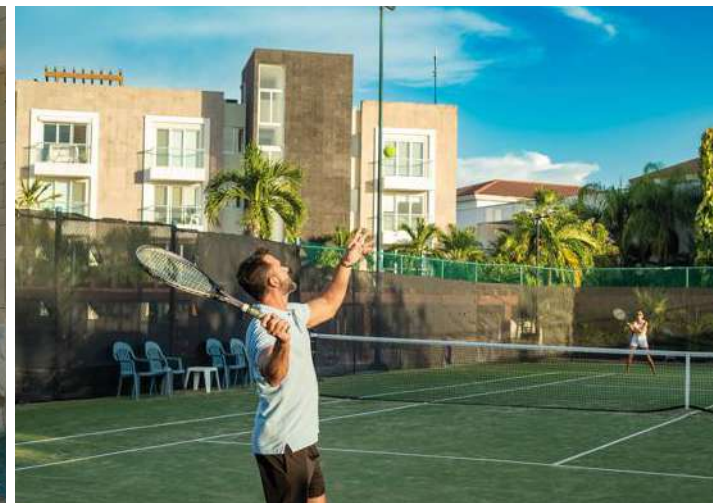
Tennis & Paddle Courts