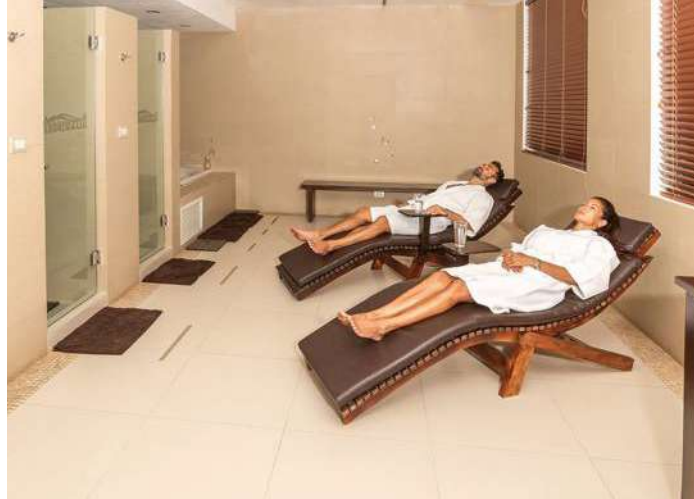
Walkways and Mayan Sculpture Park