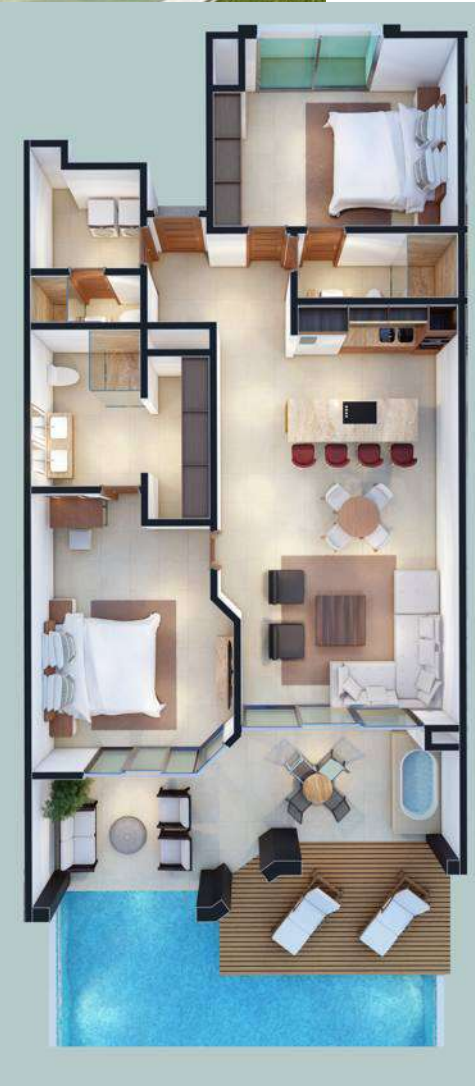
2 Bedroom Plan

Located on the ground floor, this model offers the perfect atmosphere for a lifestyle in connection with your surroundings and nature. The spacious terrace with its own private relaxation pool gives you the freedom to walk onto the beach and to create memorable experiences with your family and friends.