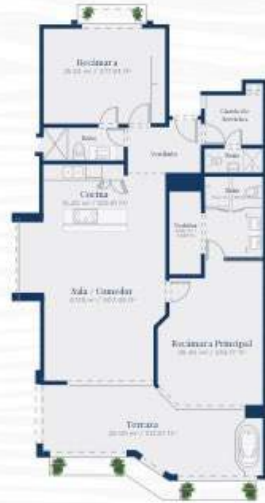
C Department 2 Rooms | 3 Bathrooms Total Area: 171.10 m 2 / 1,841.73 ft 2