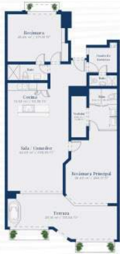
B Department 2 Rooms | 3 Bathrooms Total Area: 165.05 m 2 / 1,776.62 ft 2