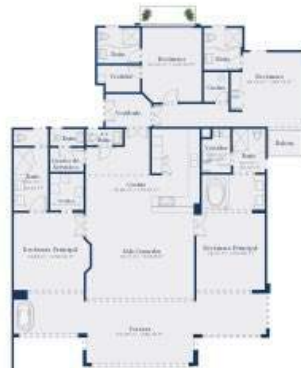
E Department 4 Rooms | 5.5 Bathrooms Total Area: 305.69 m 2 / 3,290.45 ft 2