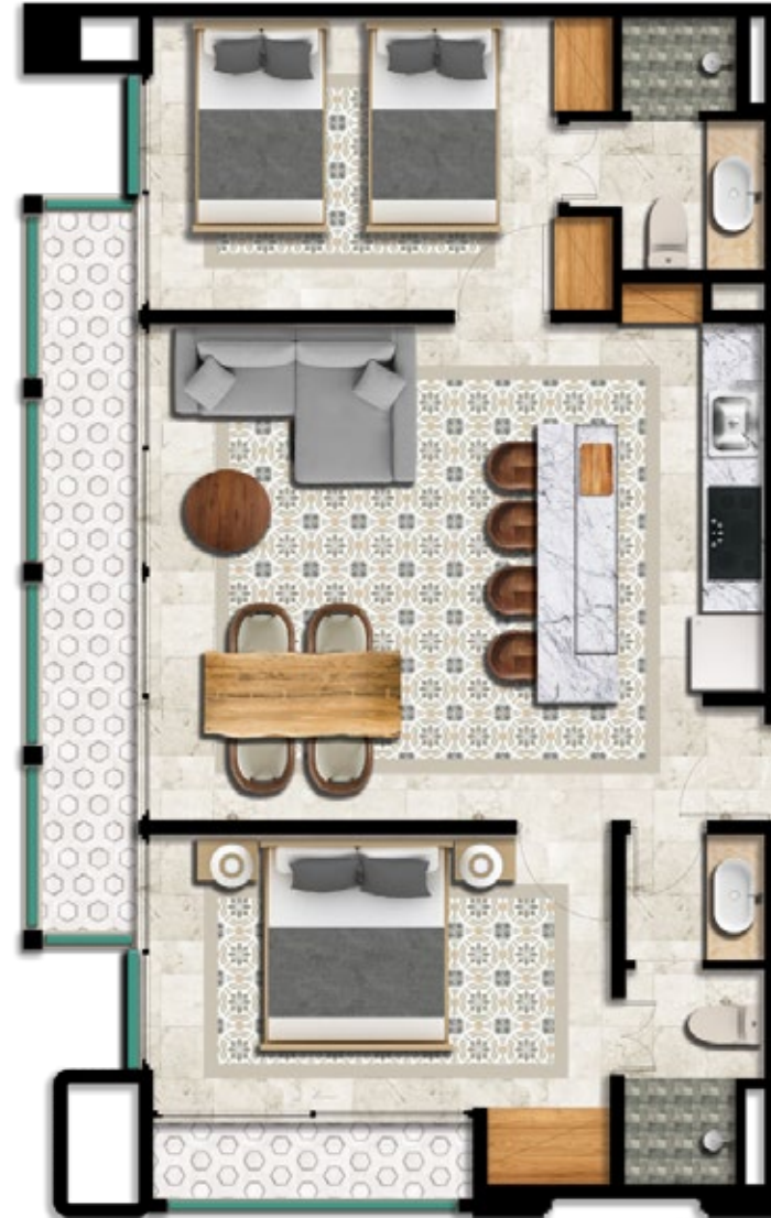
Master bedroom with full bathroom, living room, dining room, kitchen with breakfast bar, shared bathroom, secondary bedroom and terrace.