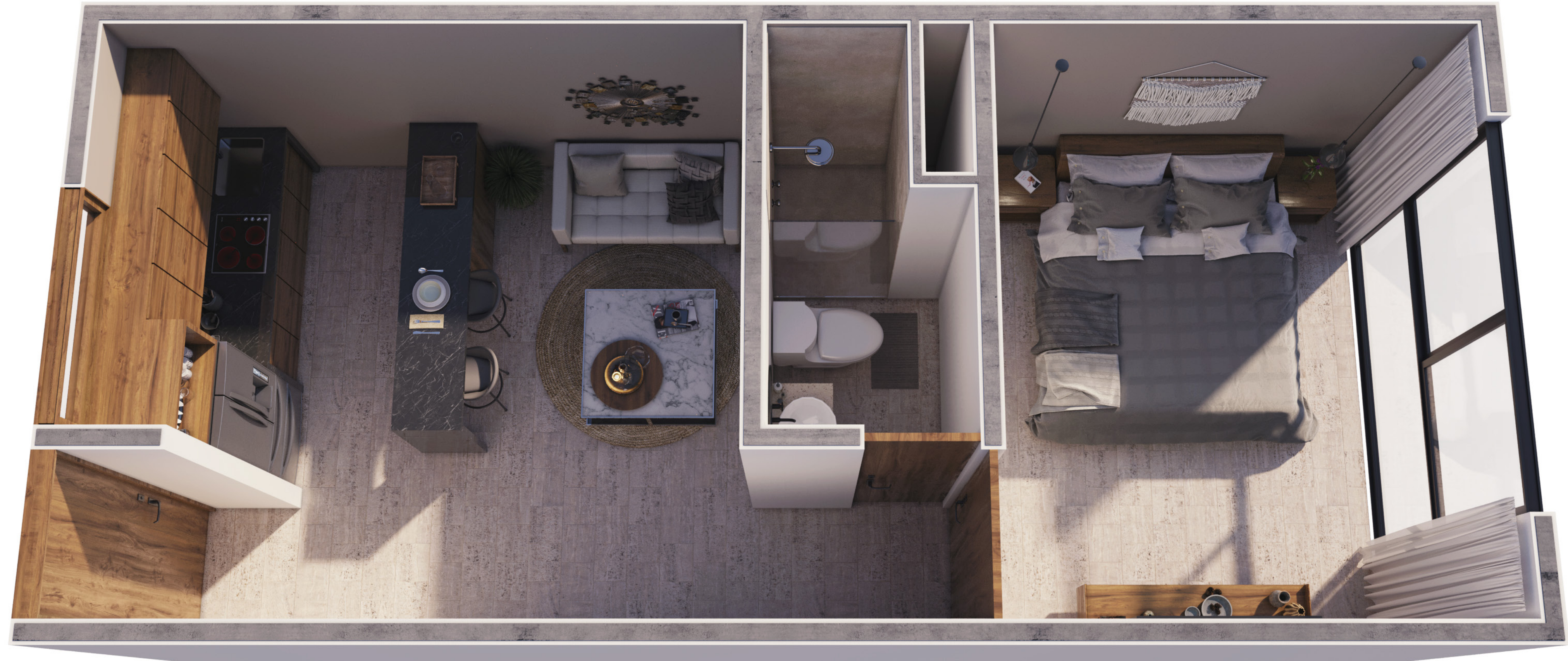
FLOOR PLAN | 1 BDR CONDO | 409 sf