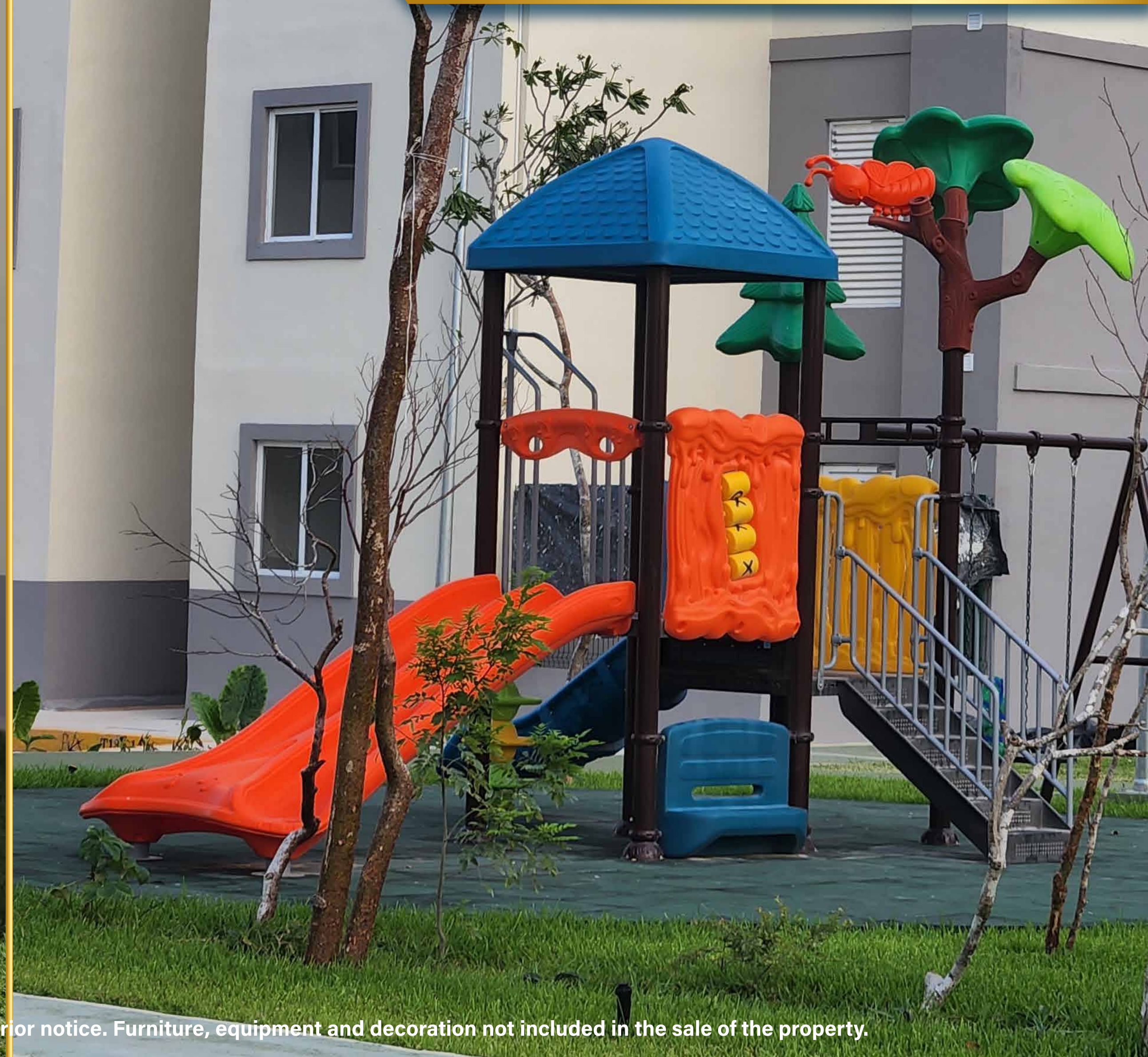
Photo for illustrative purposes only. Prices and details are subject to change without prior notice. Furniture, equipment and decoration not included in the sale of the property.