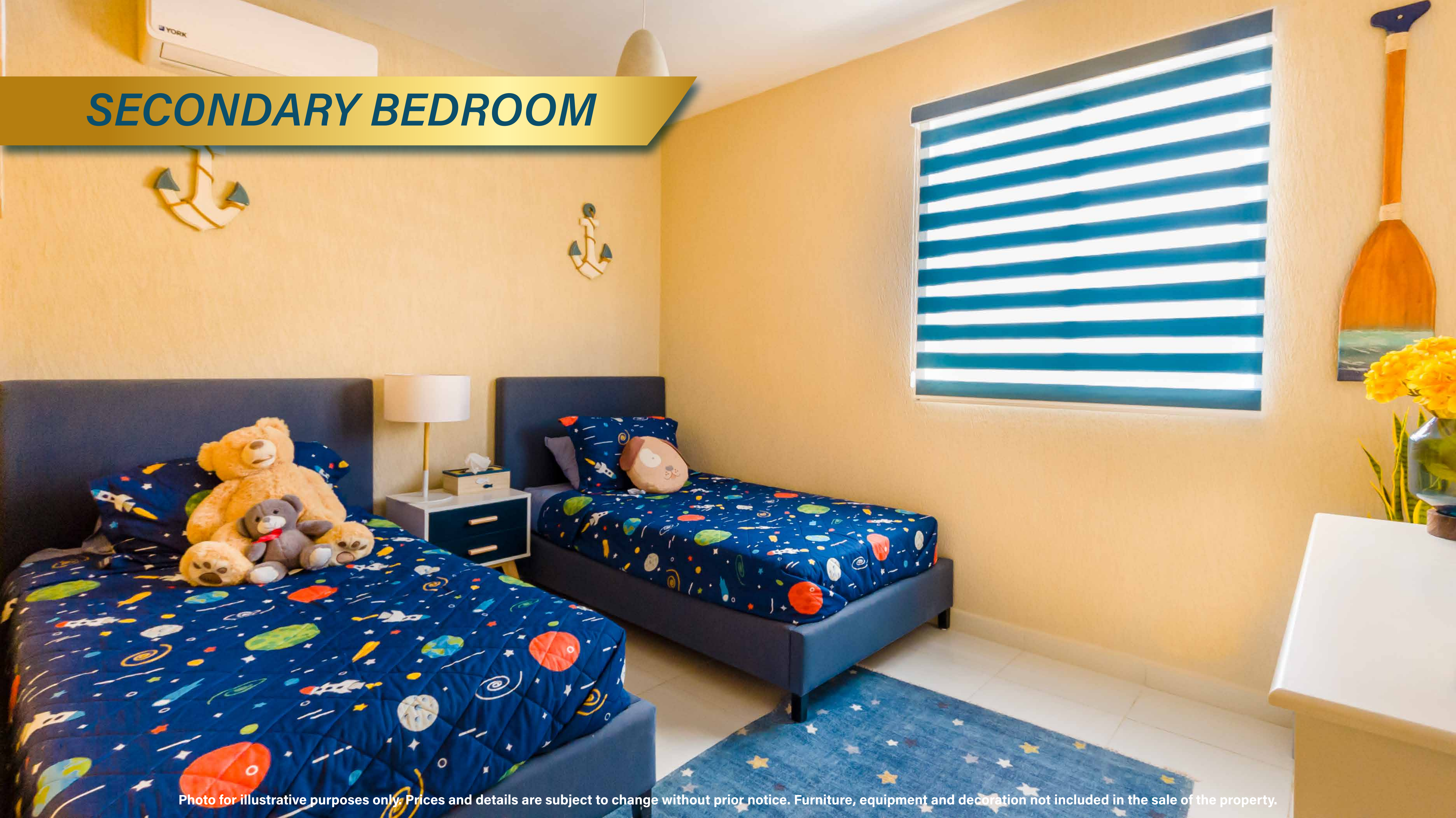
Photo for illustrative purposes only. Prices and details are subject to change without prior notice. Furniture, equipment and decoration not included in the sale of the property.