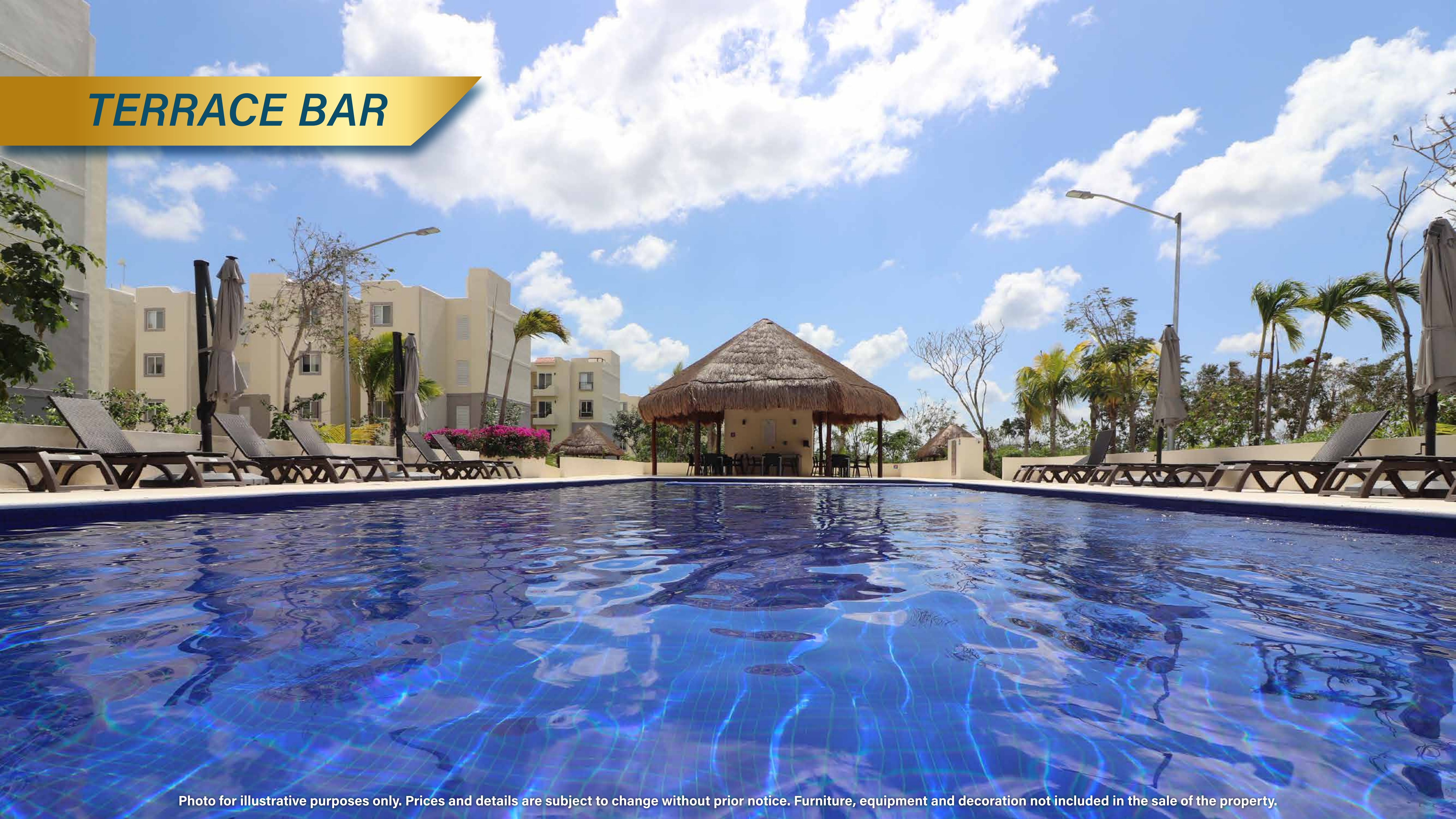
Photo for illustrative purposes only. Prices and details are subject to change without prior notice. Furniture, equipment and decoration not included in the sale of the property.