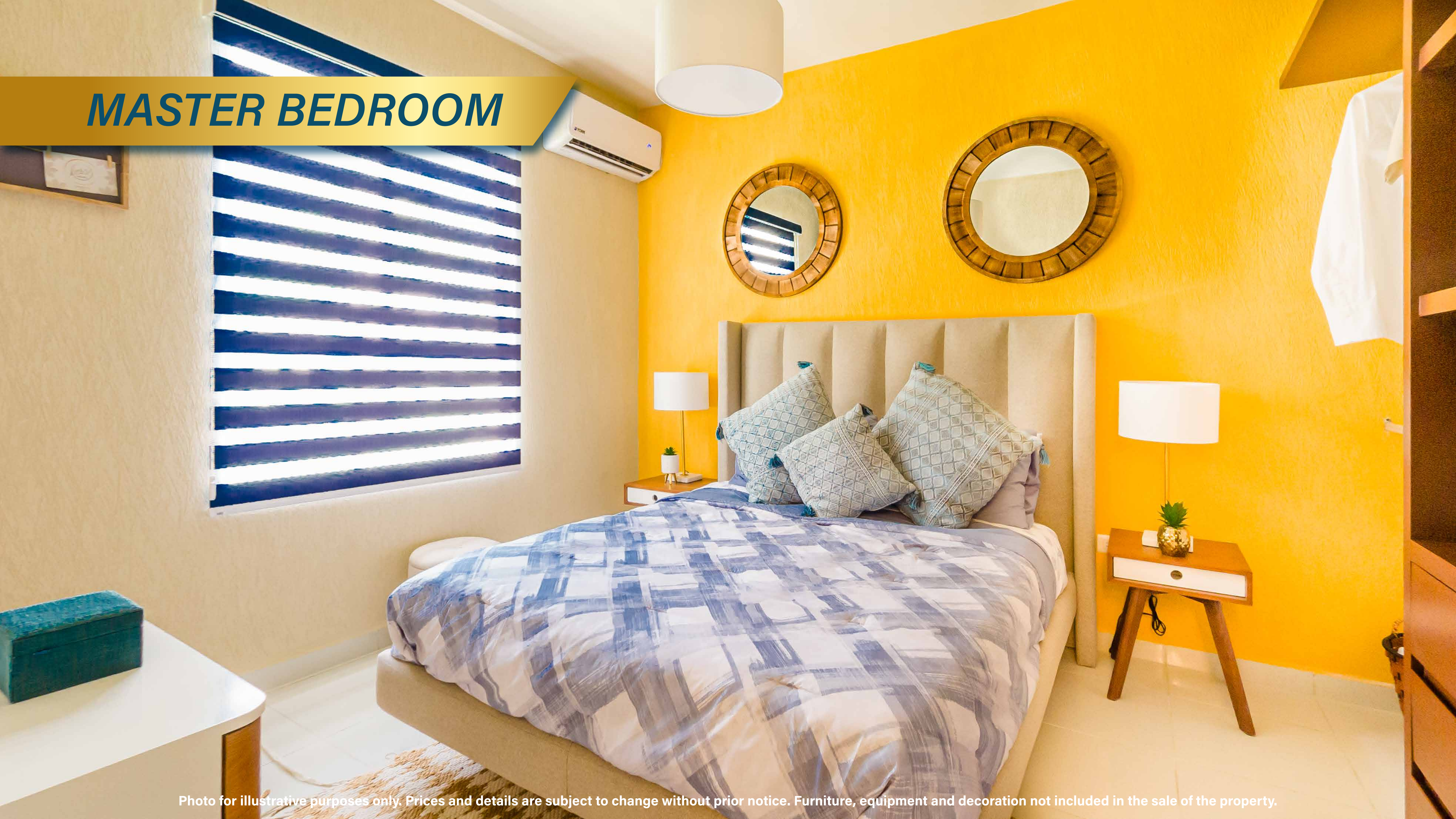
Photo for illustrative purposes only. Prices and details are subject to change without prior notice. Furniture, equipment and decoration not included in the sale of the property.