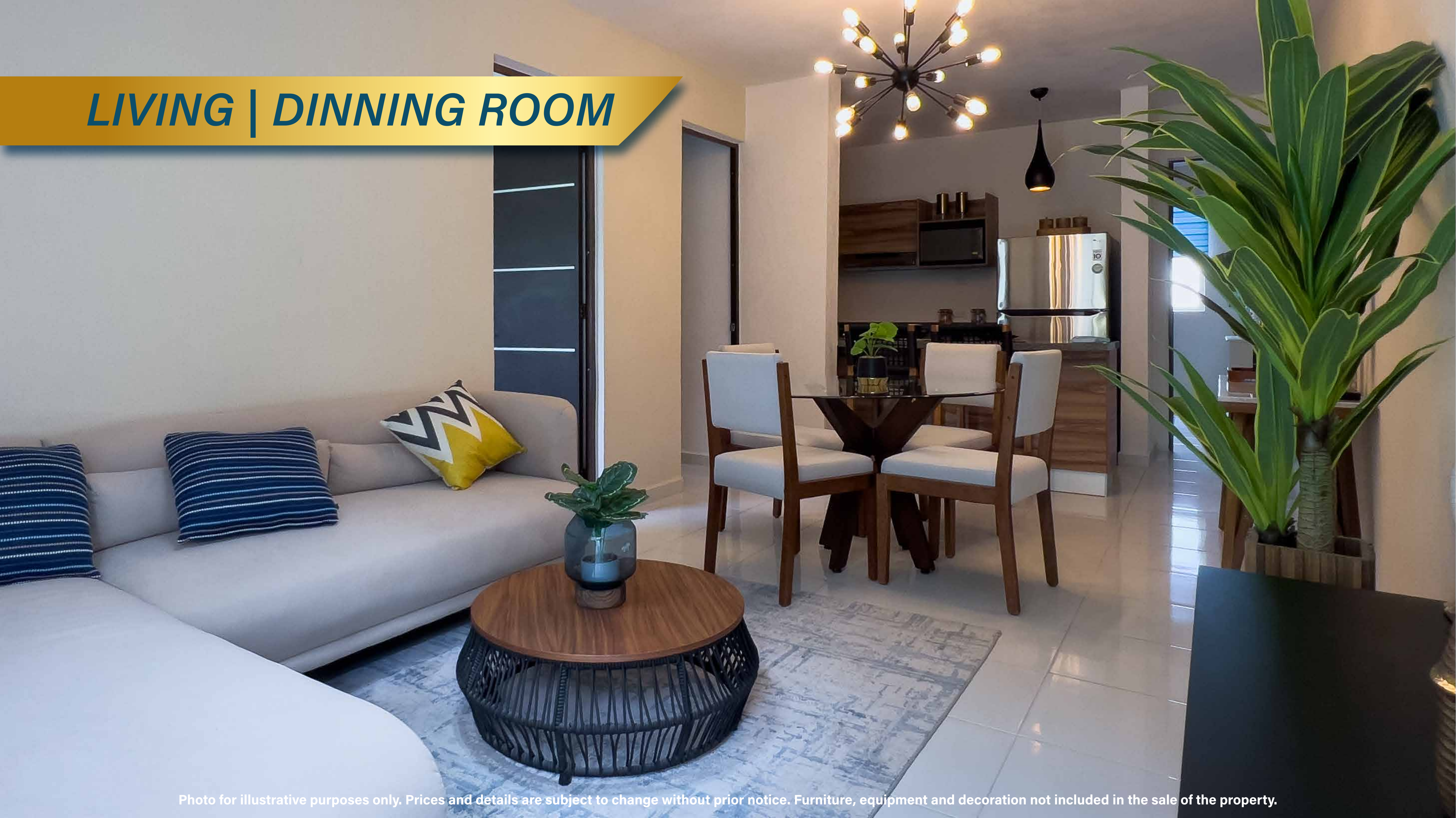
Photo for illustrative purposes only. Prices and details are subject to change without prior notice. Furniture, equipment and decoration not included in the sale of the property.