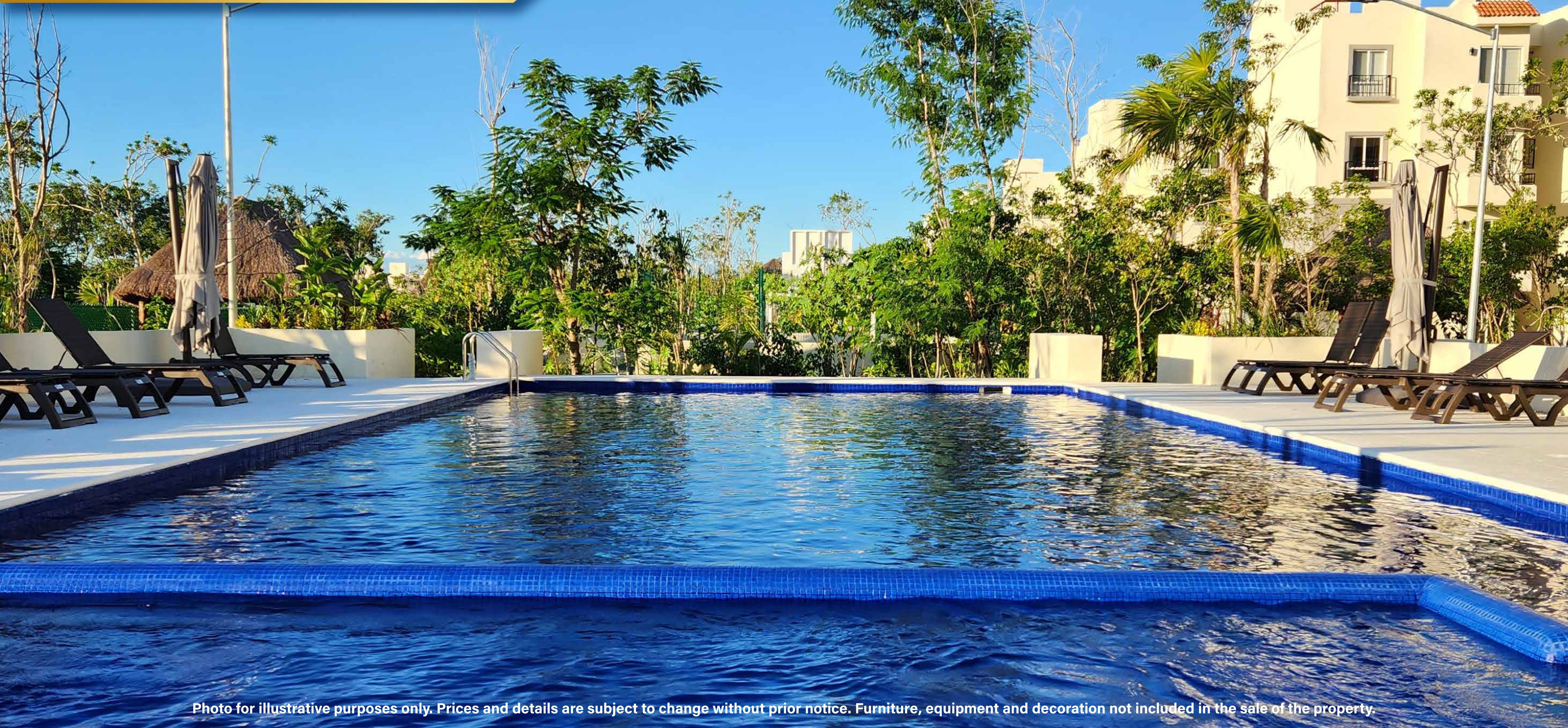
Photo for illustrative purposes only. Prices and details are subject to change without prior notice. Furniture, equipment and decoration not included in the sale of the property.