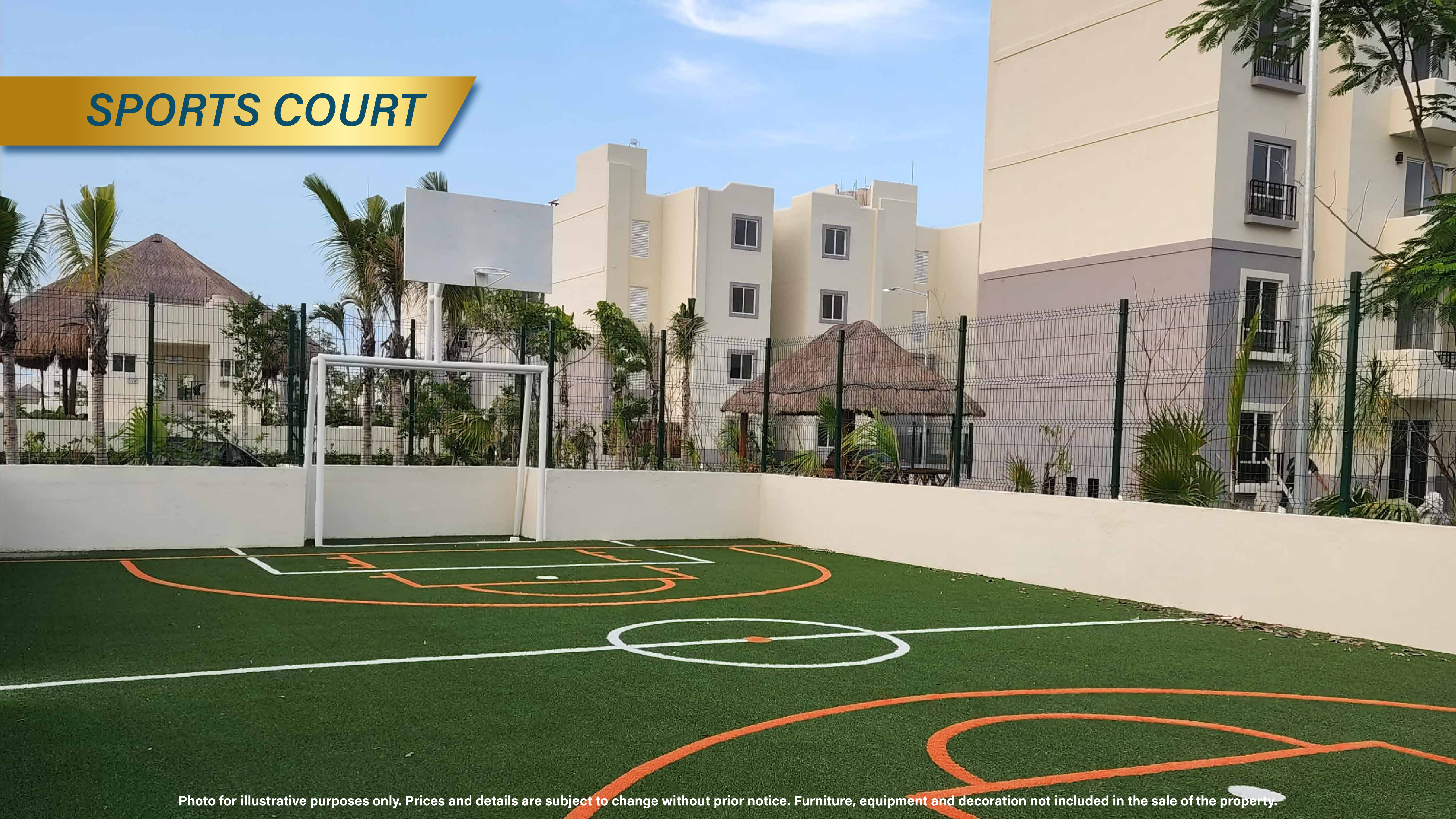
Photo for illustrative purposes only. Prices and details are subject to change without prior notice. Furniture, equipment and decoration not included in the sale of the property.