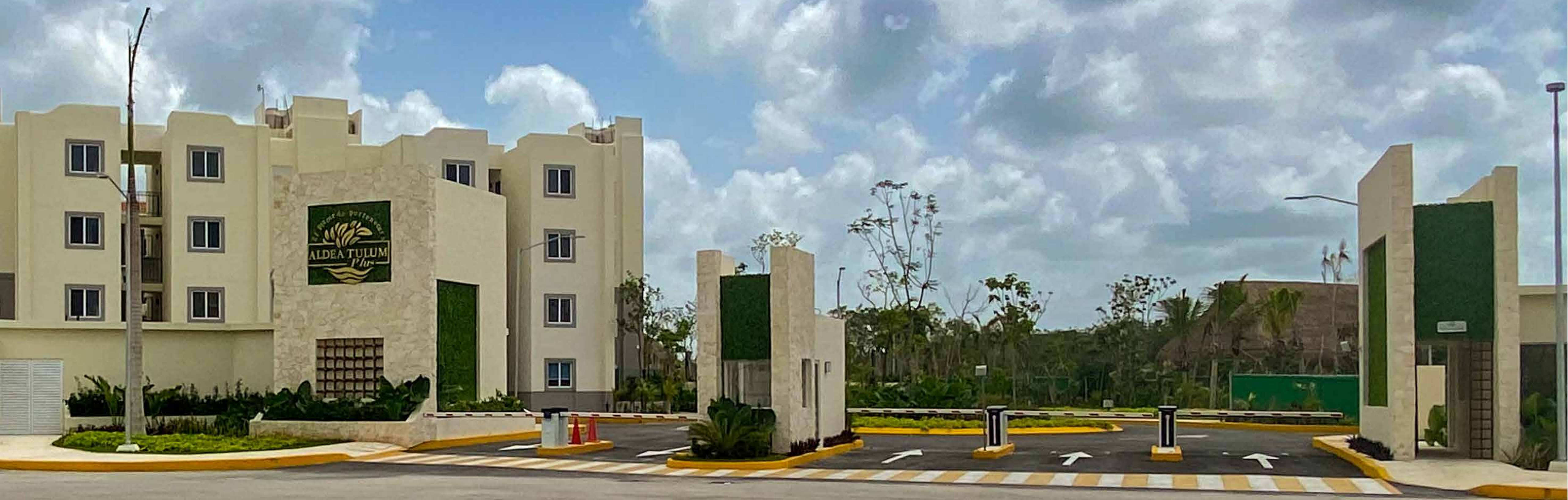
Photo for illustrative purposes only. Prices and details are subject to change without prior notice. Furniture, equipment and decoration not included in the sale of the property.