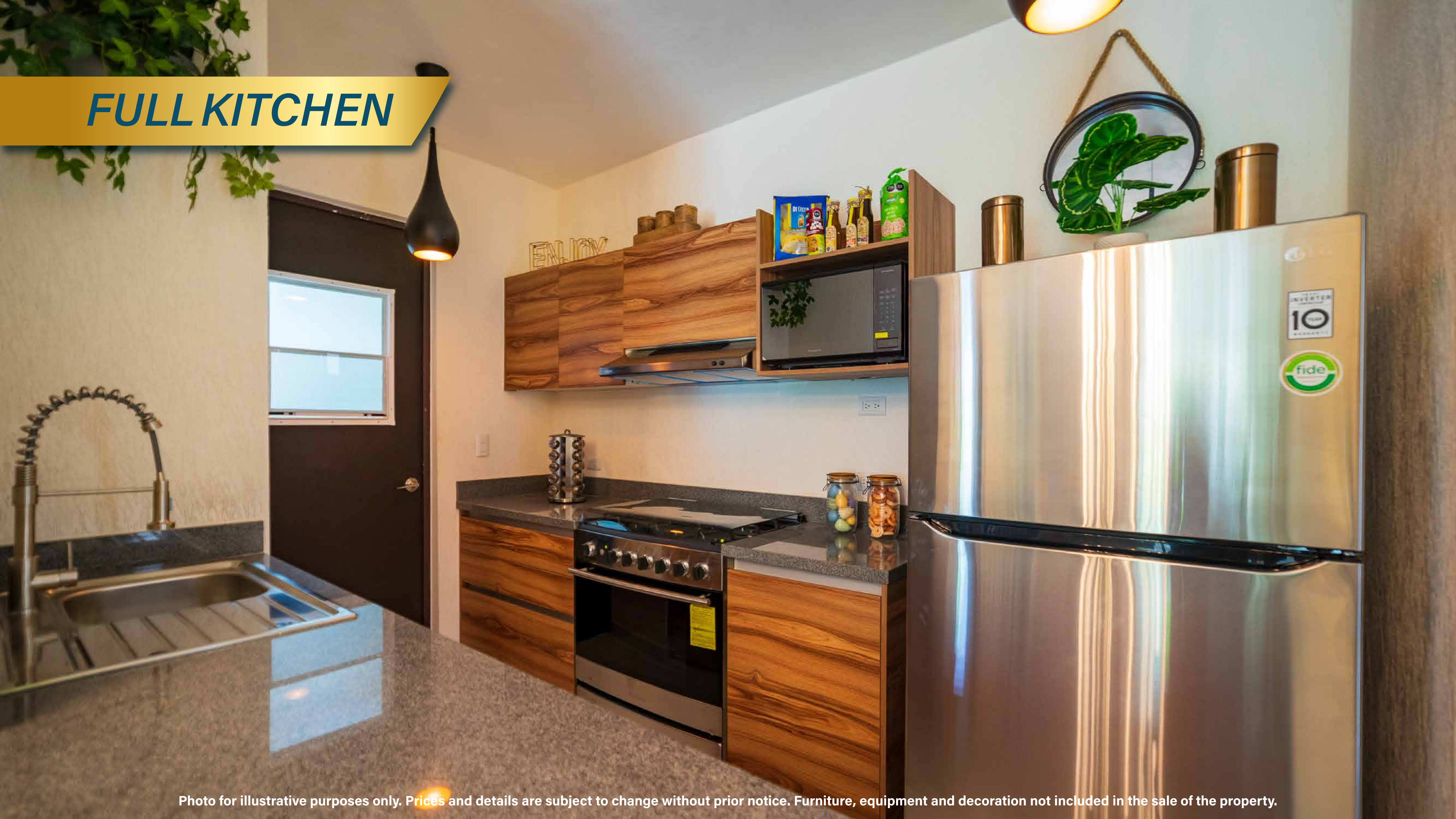
Photo for illustrative purposes only. Prices and details are subject to change without prior notice. Furniture, equipment and decoration not included in the sale of the property.