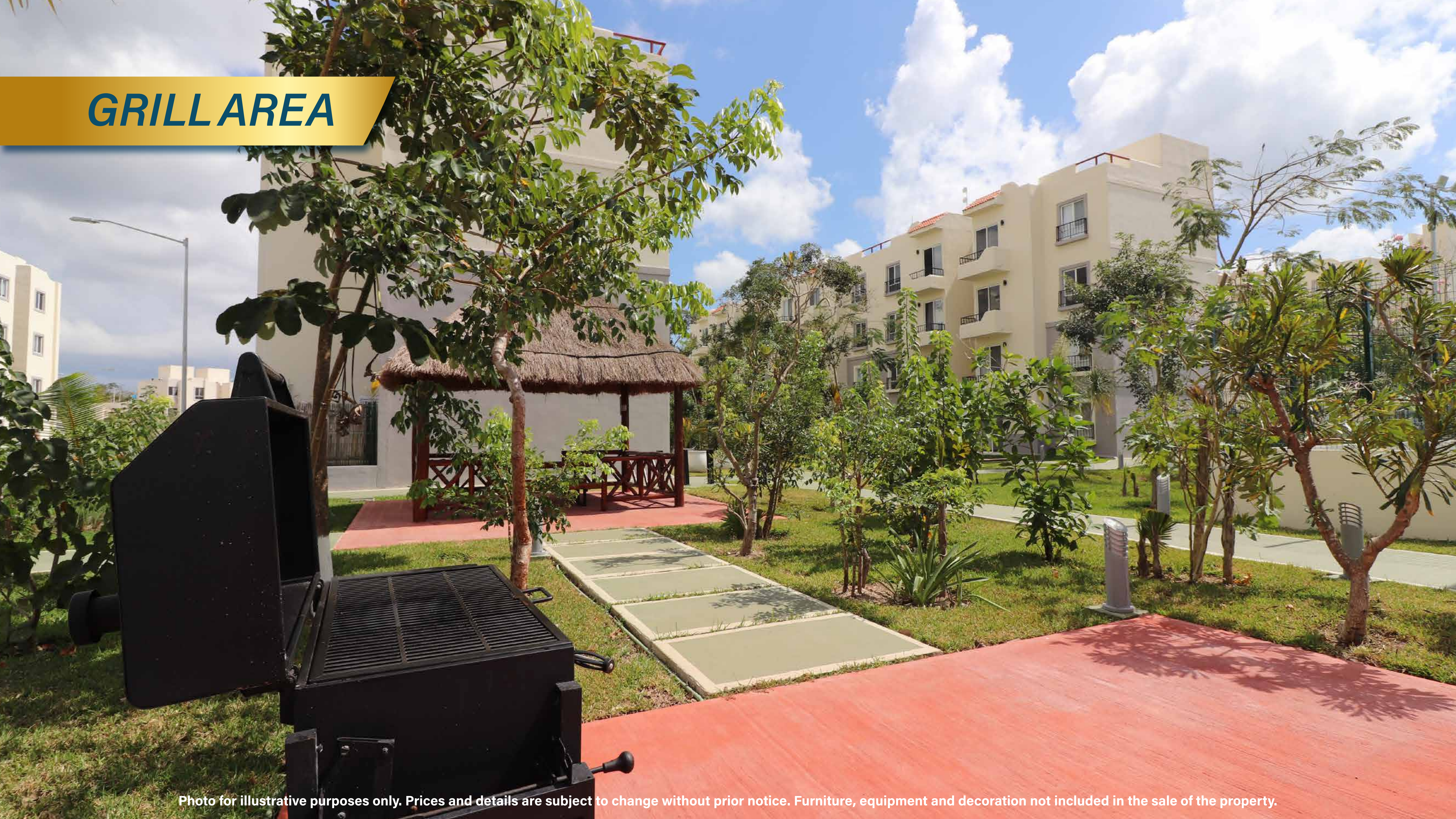
Photo for illustrative purposes only. Prices and details are subject to change without prior notice. Furniture, equipment and decoration not included in the sale of the property.