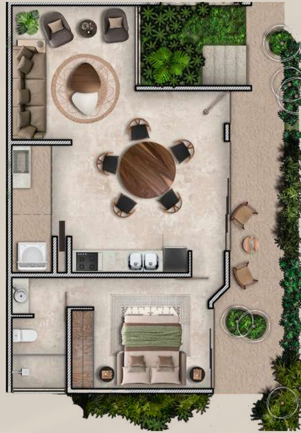
1 Bedroom Garden