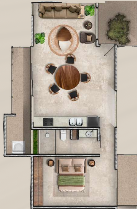
1 Bedroom Center