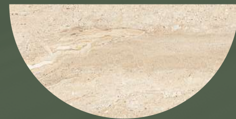
Ivory Ceramic tiles