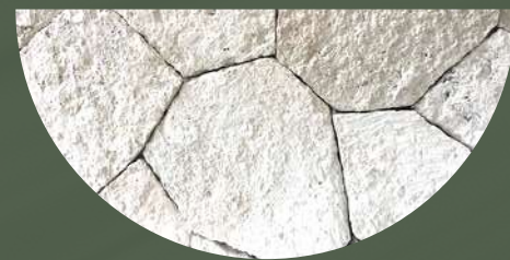
Piedra Maya (Mayan Stone)