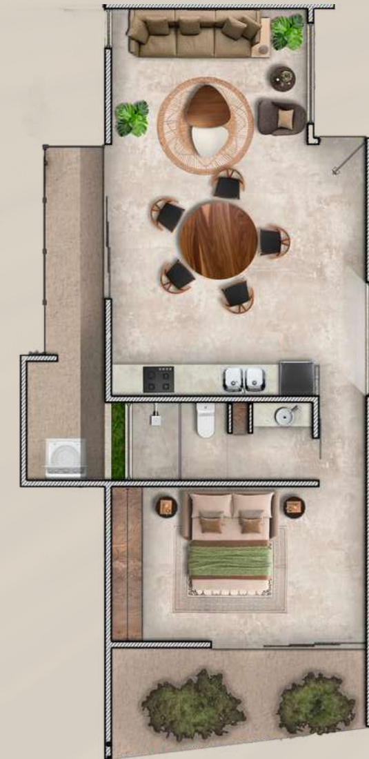
1 Bedroom Corner