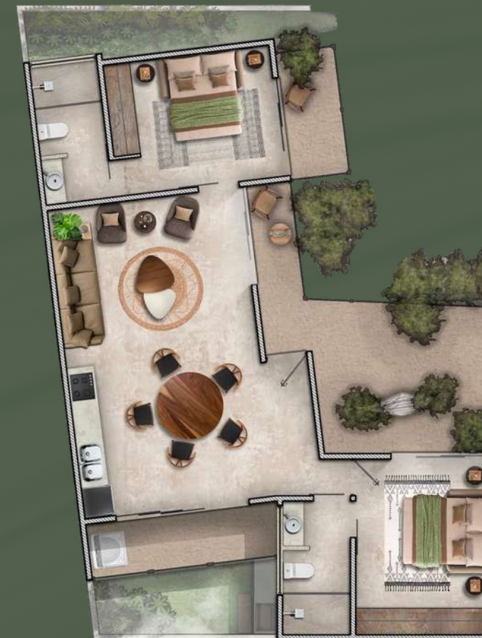
2 Bedrooms Garden 2 Lock-Off