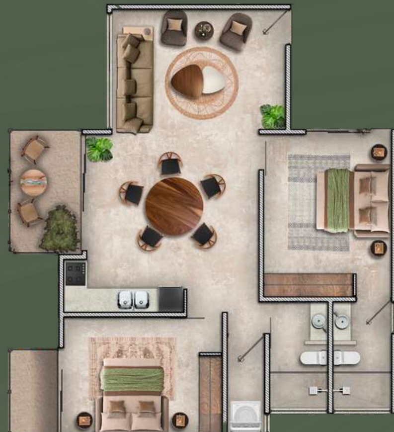
2 Bedrooms Center