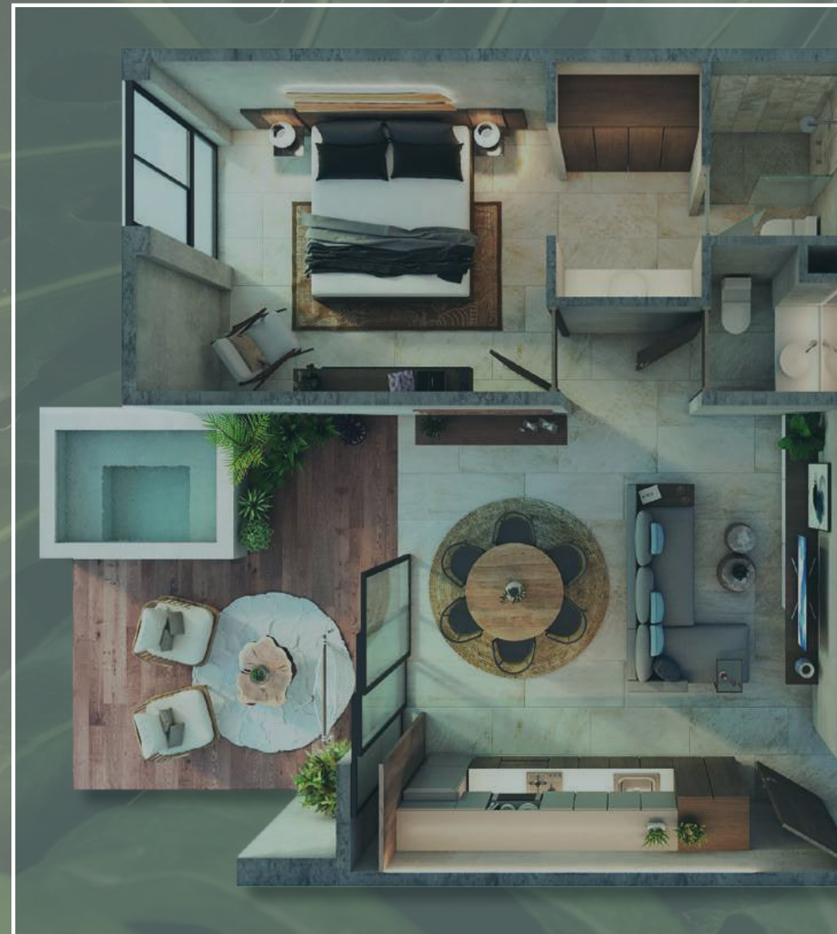
One bedroom unit

Enjoy your private space while you increase your income renting other sections of your apartment.