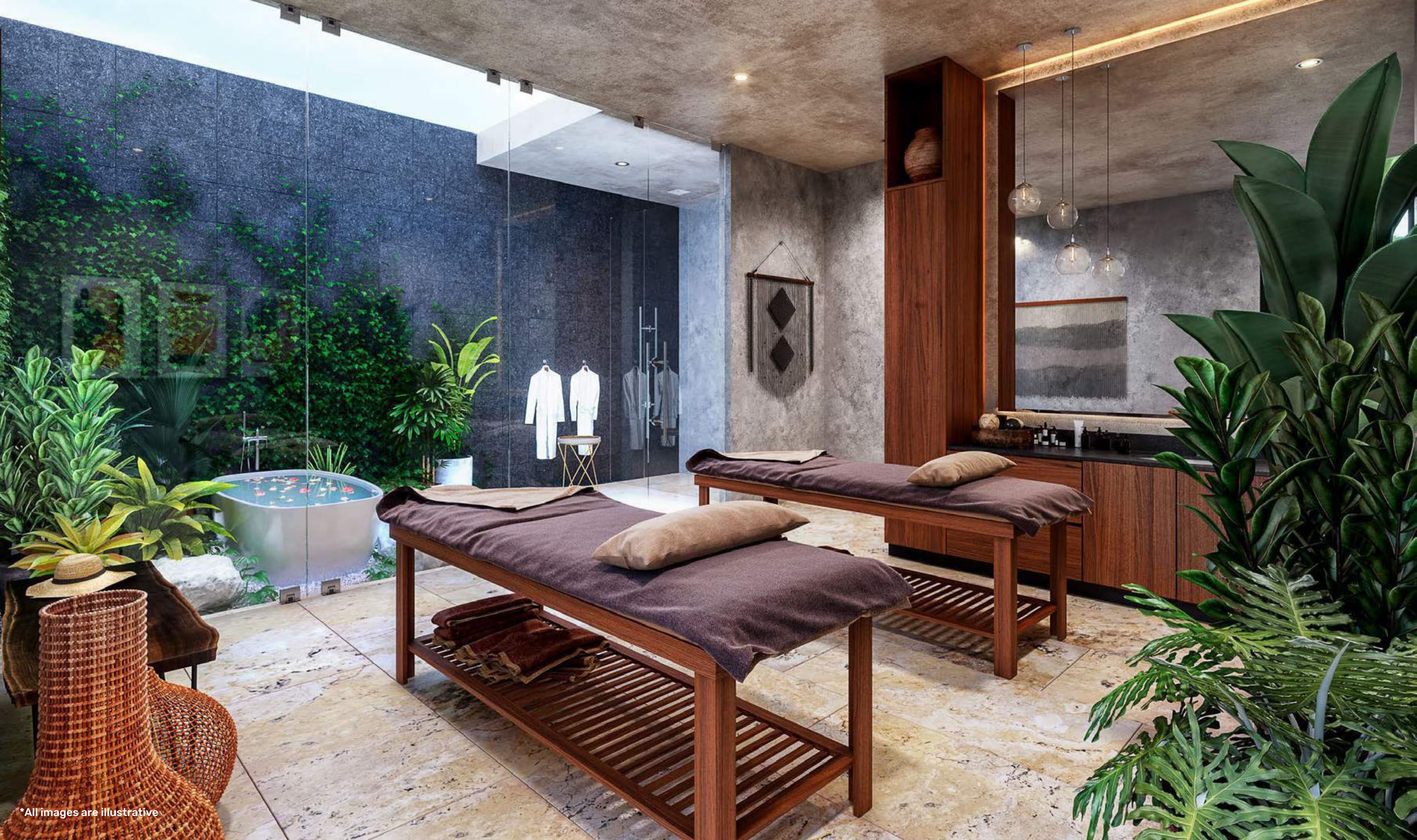
*All images are illustrative