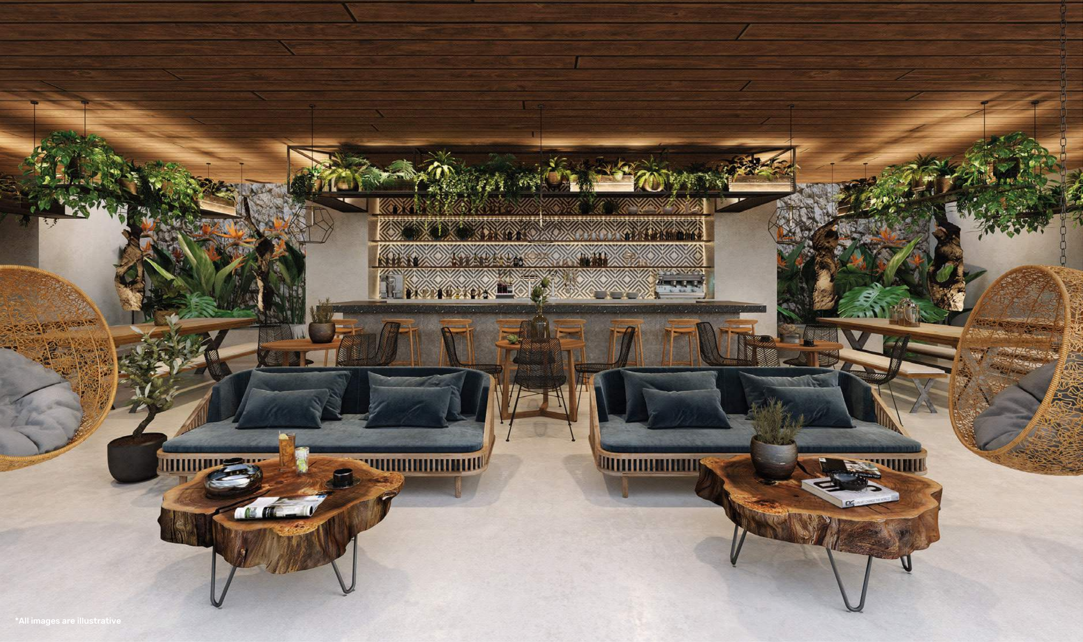
*All images are illustrative