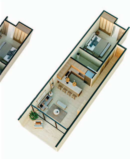
1 Bedroom Jungle View