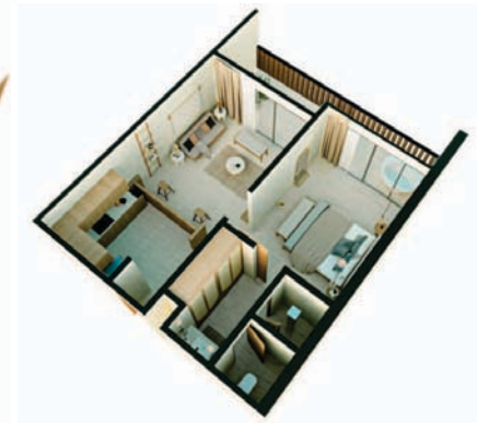
1 Bedroom Living