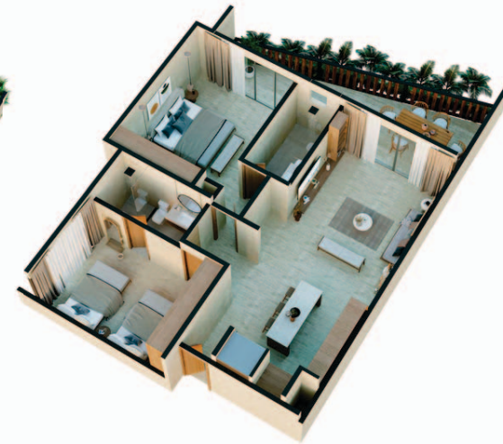
2 Bedrooms Jungle View