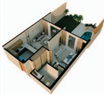
1 Bedroom Garden