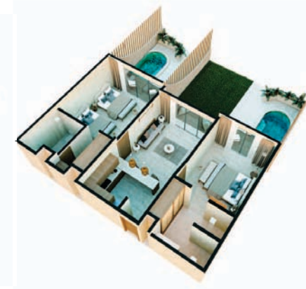
2 Bedrooms Garden LO