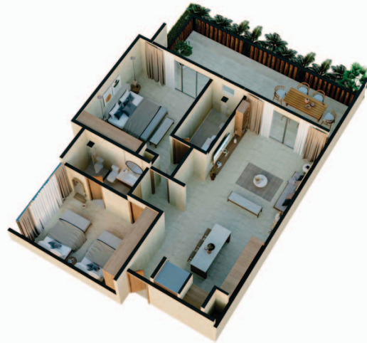
2 Bedrooms Garden Jungle View