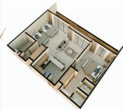
2 Bedrooms Living LO