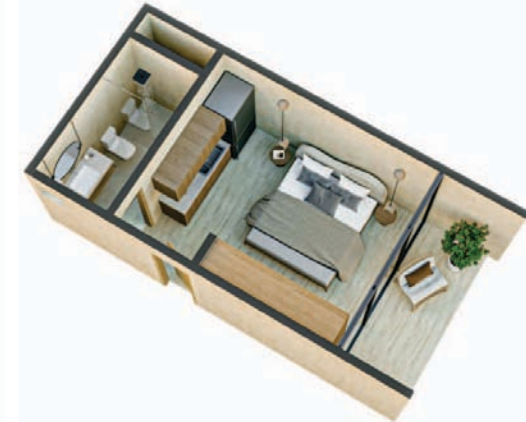
Studio Jungle View