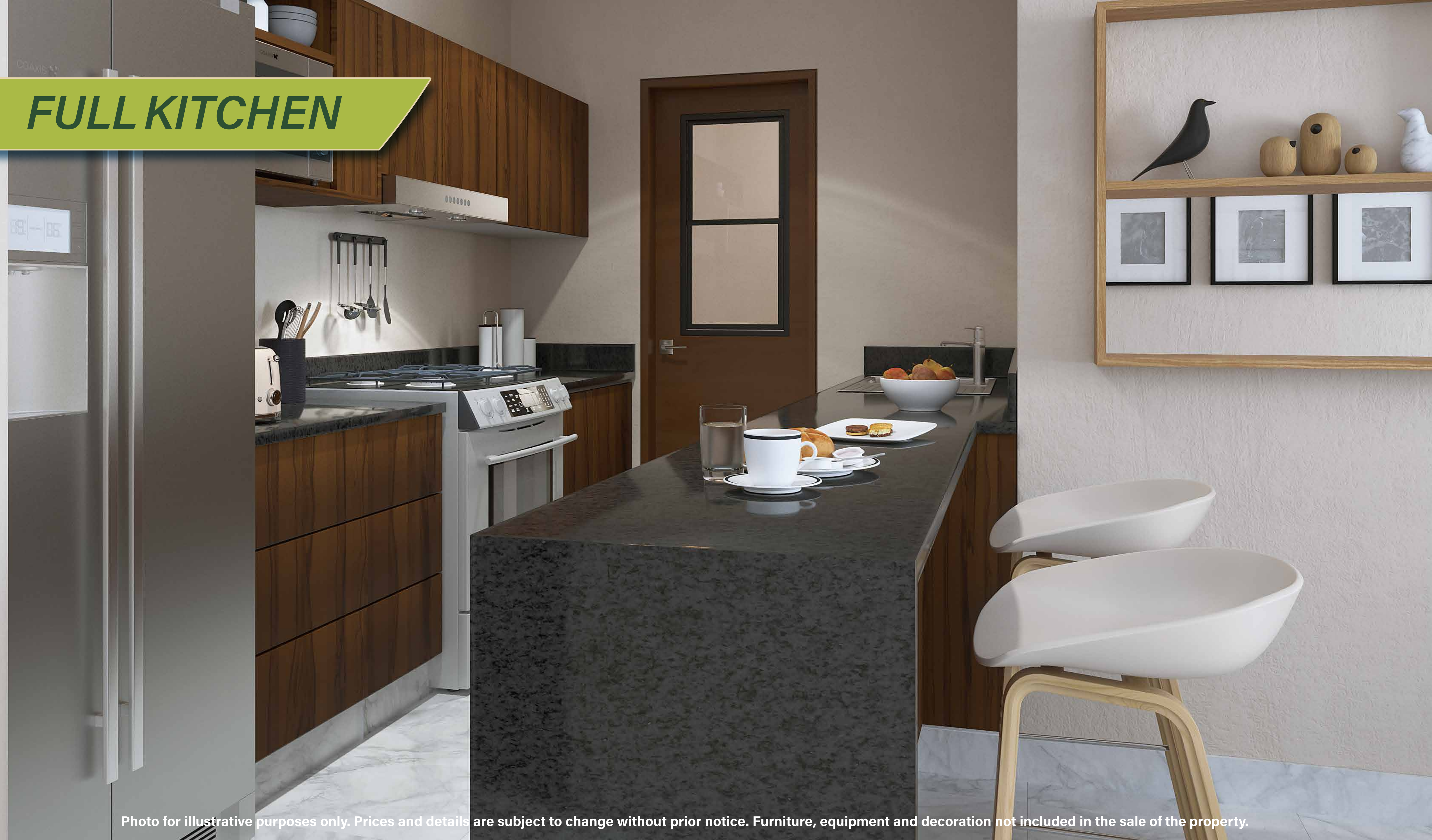
Photo for illustrative purposes only. Prices and details are subject to change without prior notice. Furniture, equipment and decoration not included in the sale of the property.