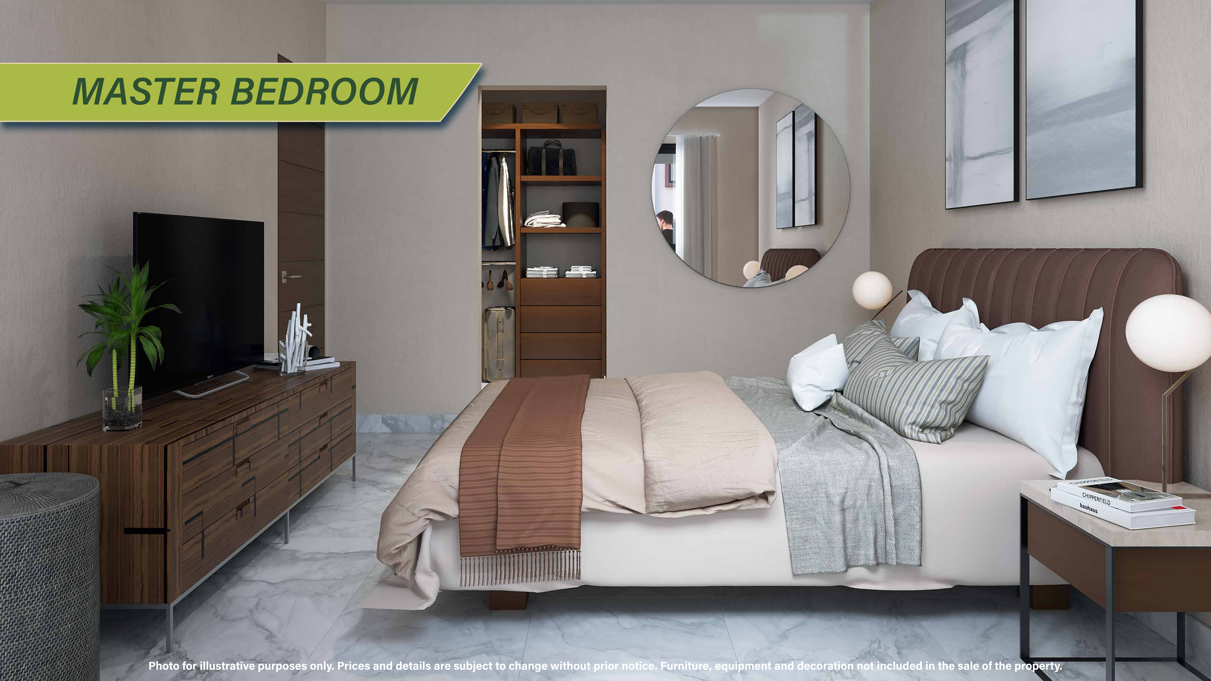
Photo for illustrative purposes only. Prices and details are subject to change without prior notice. Furniture, equipment and decoration not included in the sale of the property.