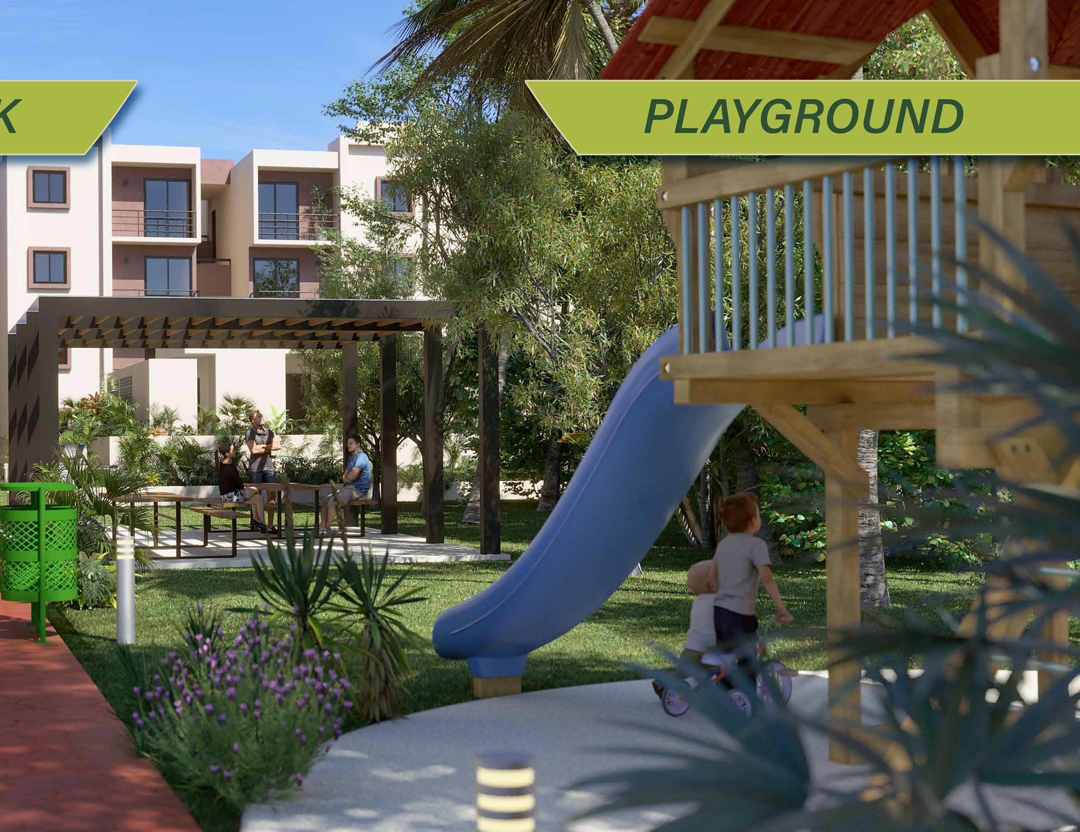
Photo for illustrative purposes only. Prices and details are subject to change without prior notice. Furniture, equipment and decoration not included in the sale of the property.