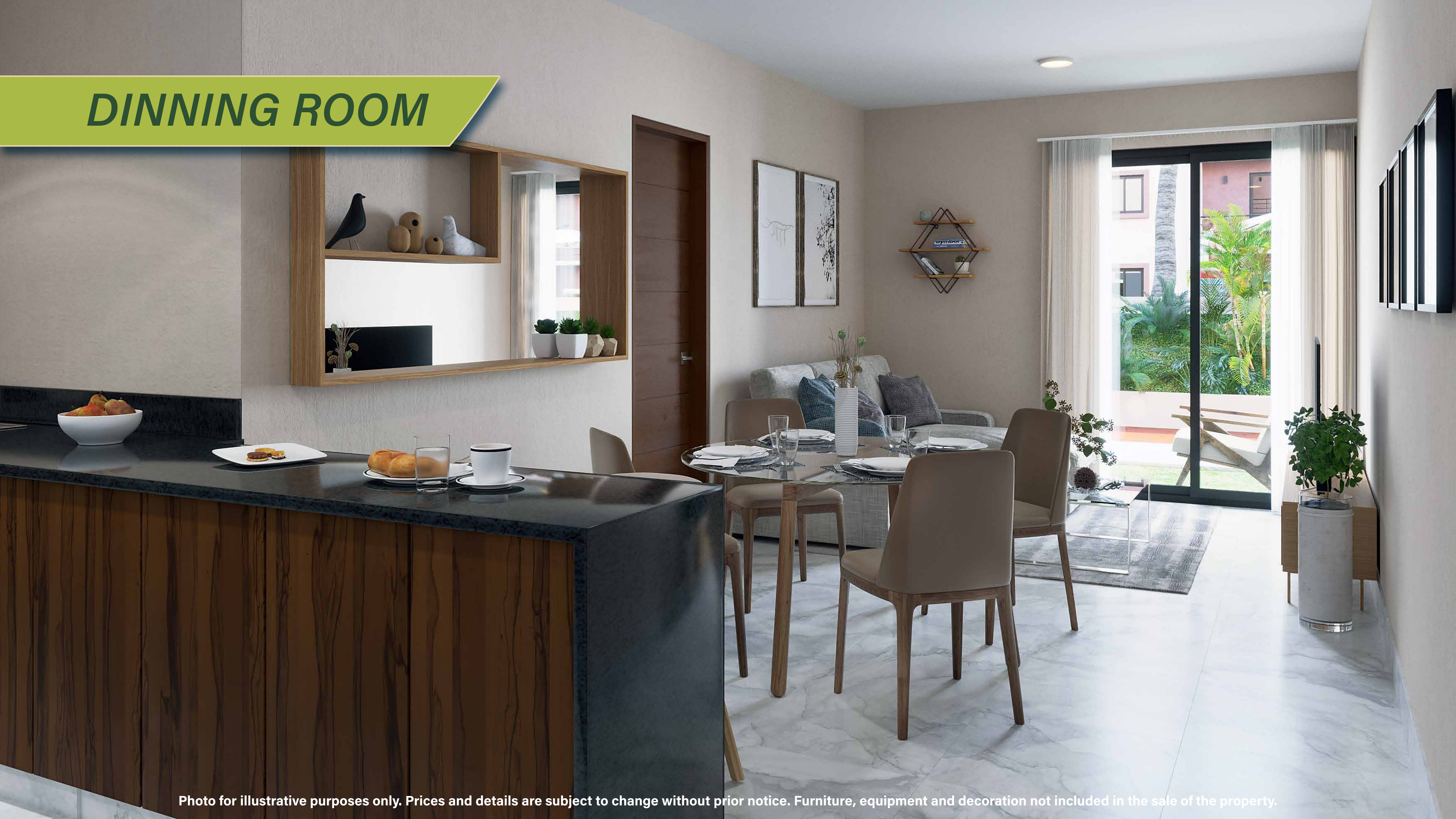
Photo for illustrative purposes only. Prices and details are subject to change without prior notice. Furniture, equipment and decoration not included in the sale of the property.