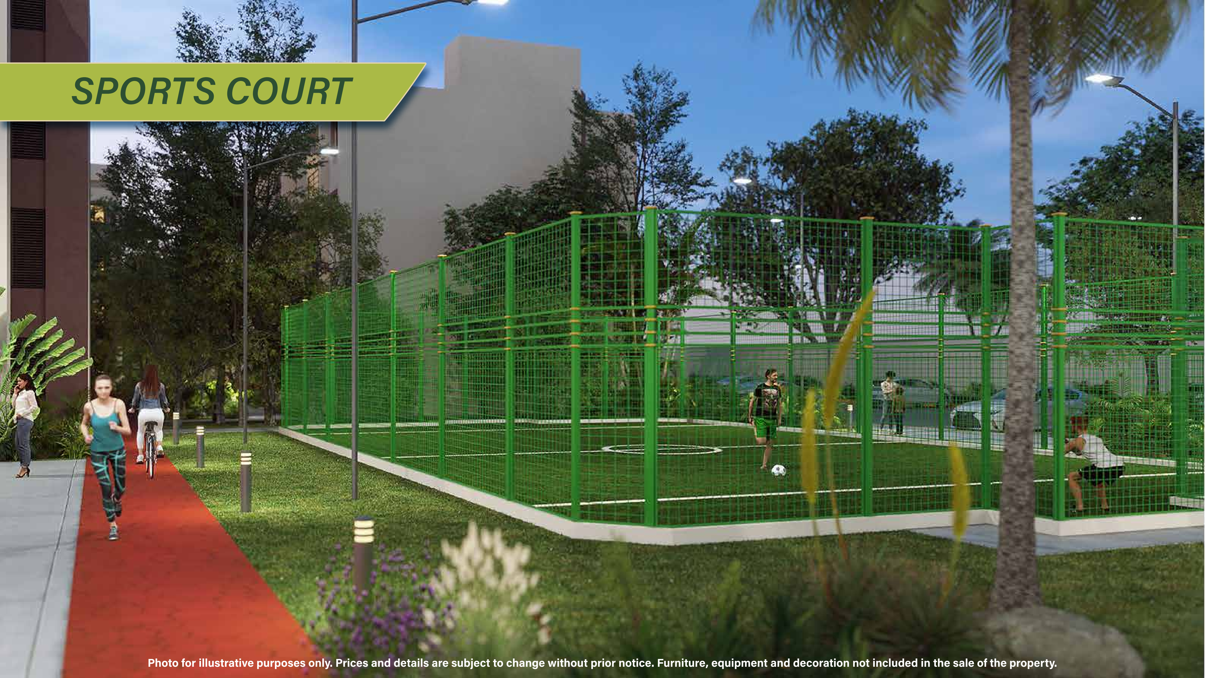
Photo for illustrative purposes only. Prices and details are subject to change without prior notice. Furniture, equipment and decoration not included in the sale of the property.