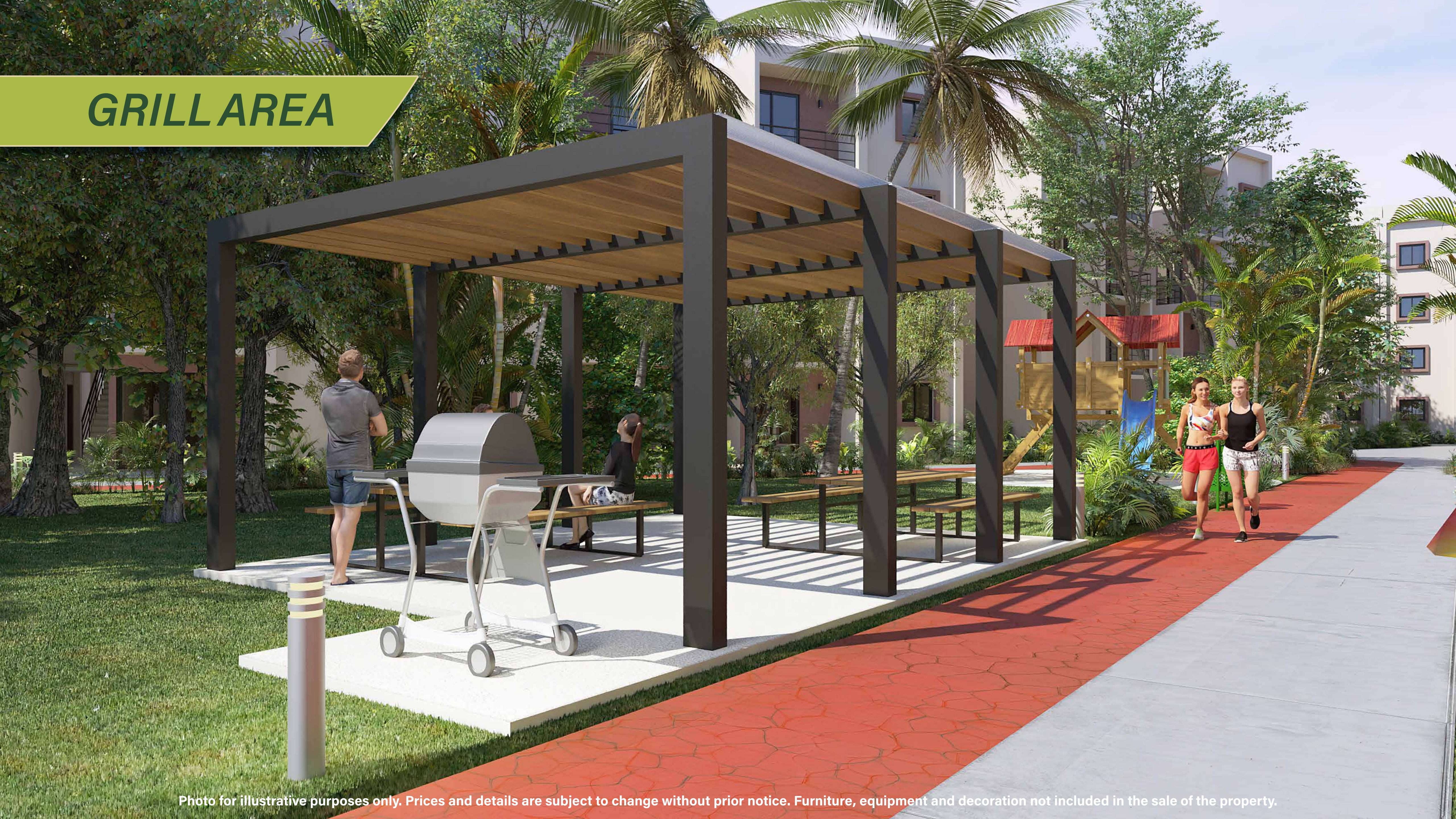
Photo for illustrative purposes only. Prices and details are subject to change without prior notice. Furniture, equipment and decoration not included in the sale of the property.