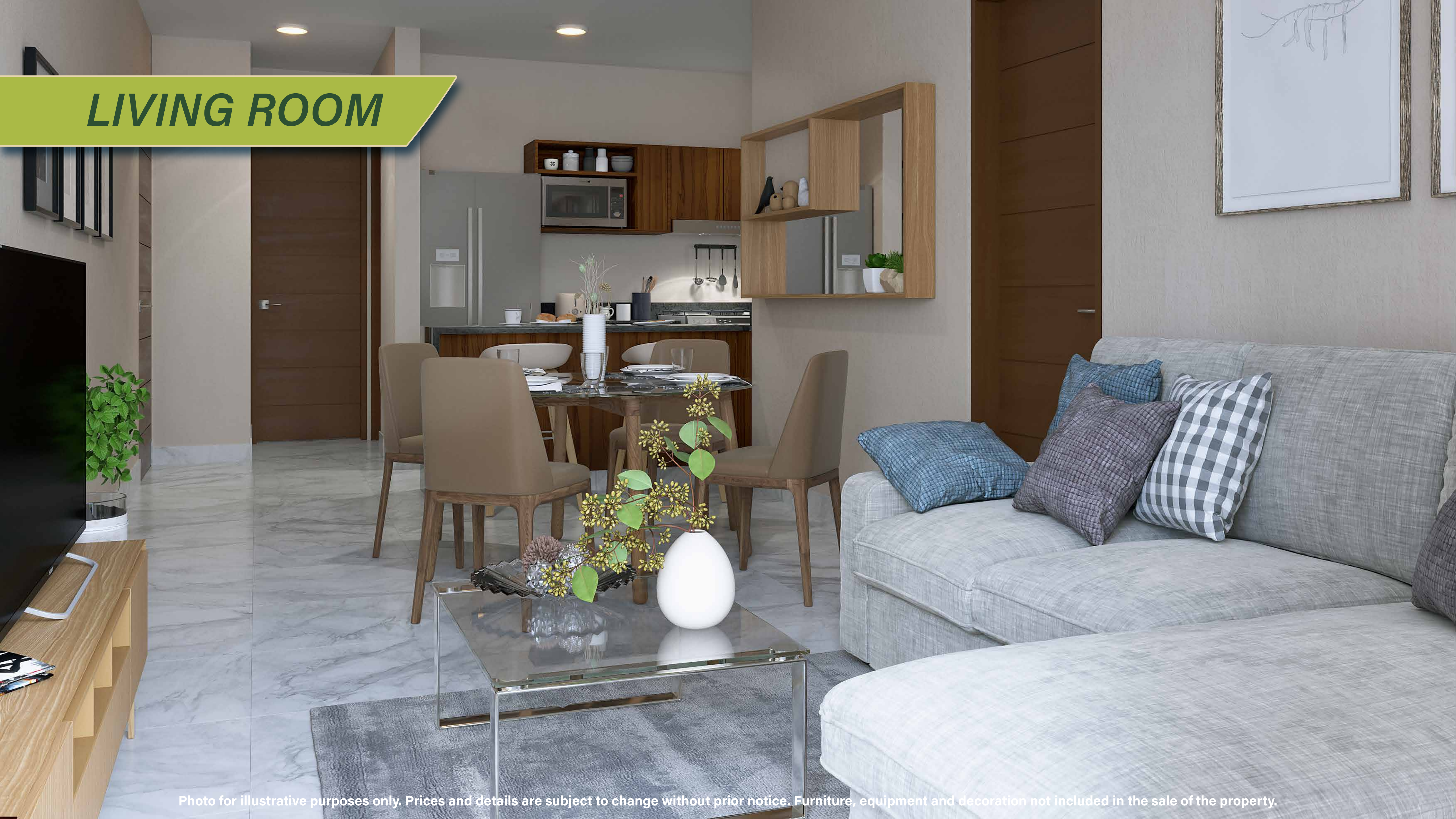
Photo for illustrative purposes only. Prices and details are subject to change without prior notice. Furniture, equipment and decoration not included in the sale of the property.