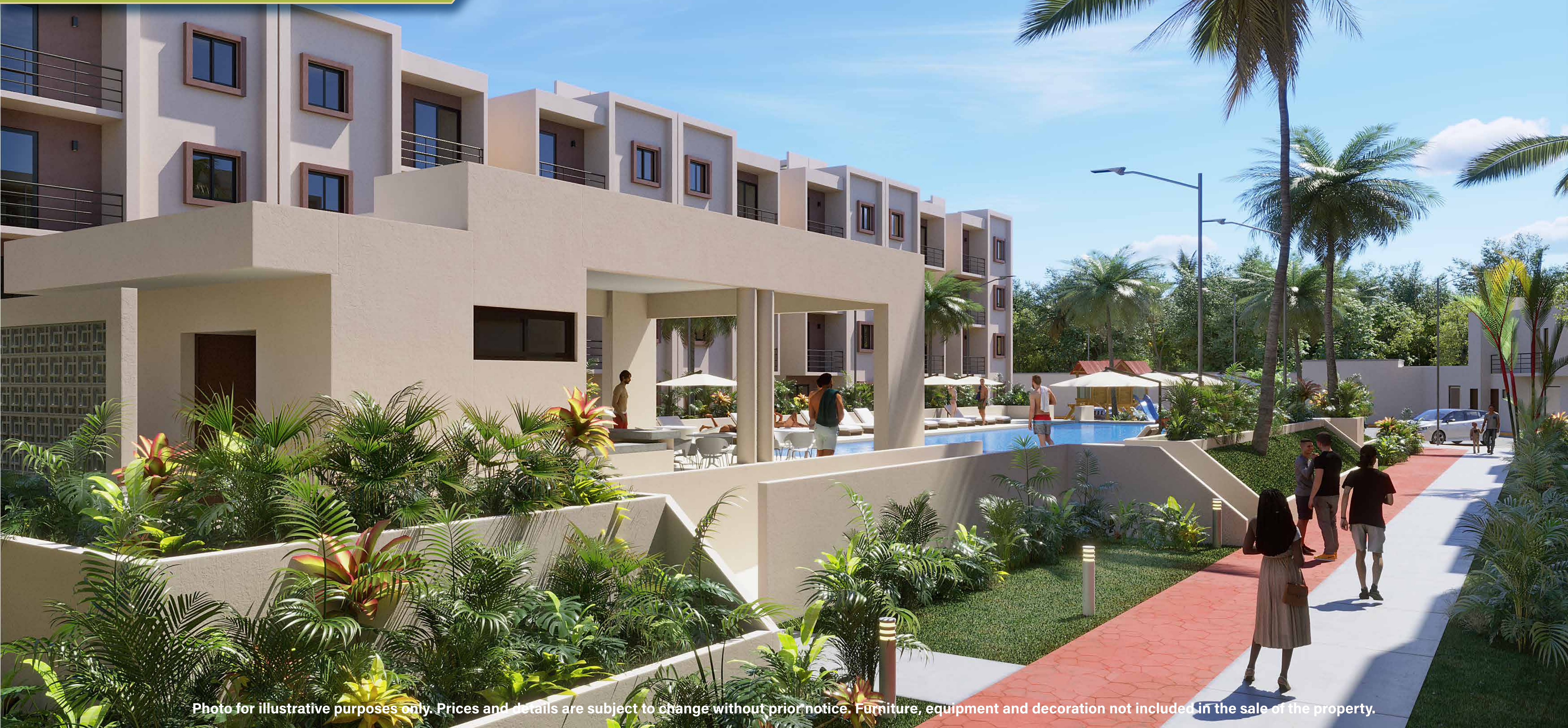
Photo for illustrative purposes only. Prices and details are subject to change without prior notice. Furniture, equipment and decoration not included in the sale of the property.