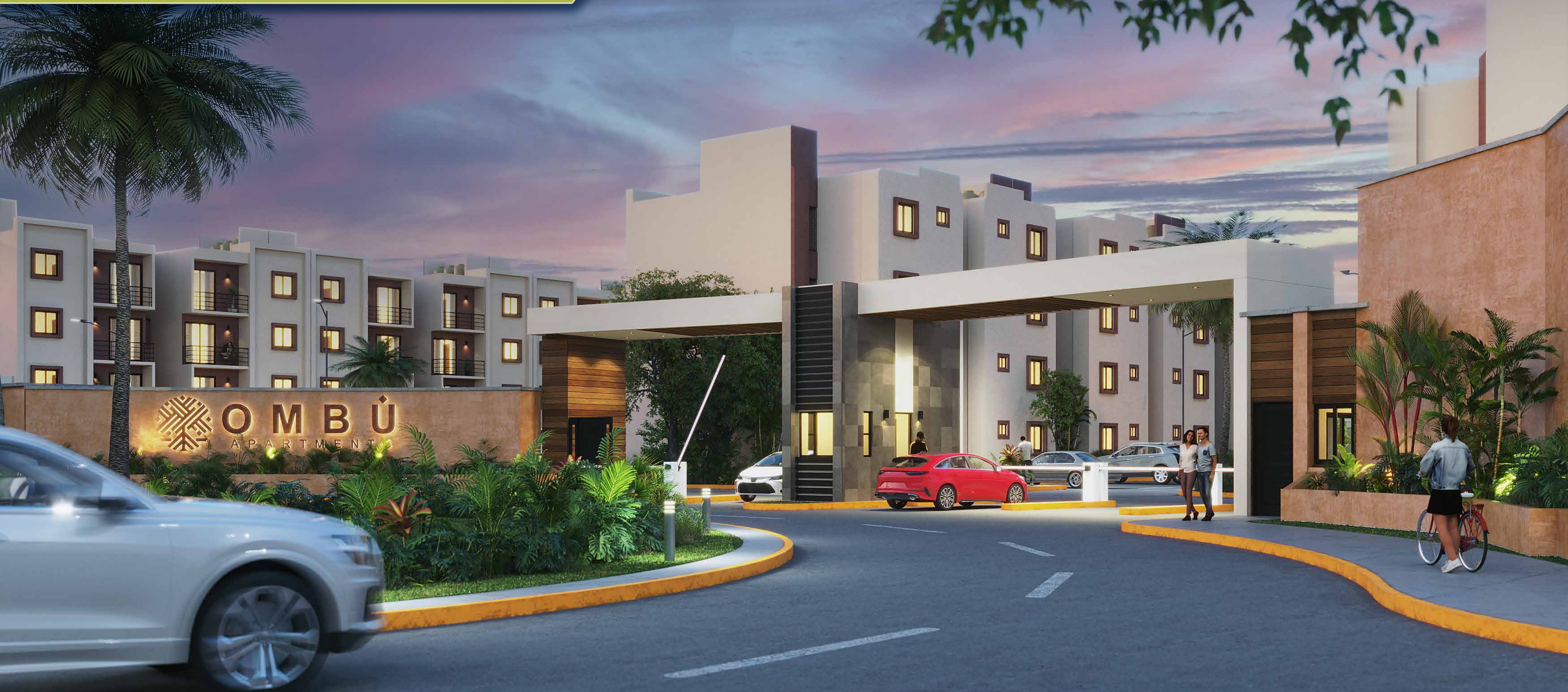
Photo for illustrative purposes only. Prices and details are subject to change without prior notice. Furniture, equipment and decoration not included in the sale of the property.