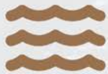
Rooftop Swimming pool

By investing in an apartment in Casa Chichil, you are not only buying a property, but also a complete life experience.