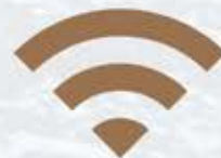
Wi-Fi in Common Areas